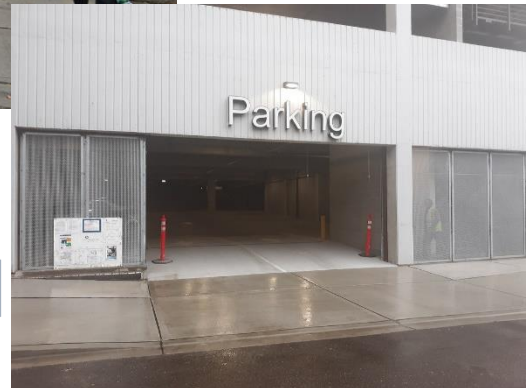
P4/P5 Garage Entrance