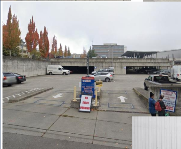
E Lot Entrance