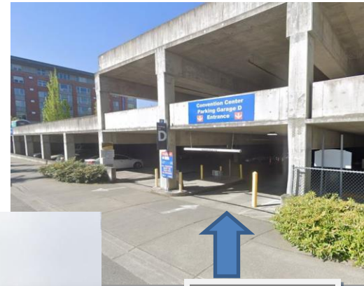
D Lot Entrance